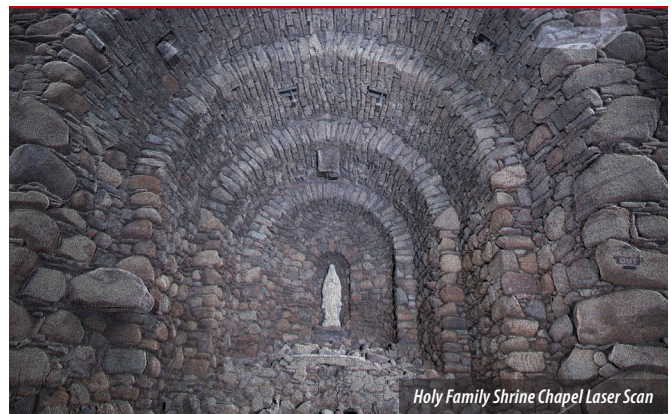
Holy Family Shrine Chapel Laser Scan