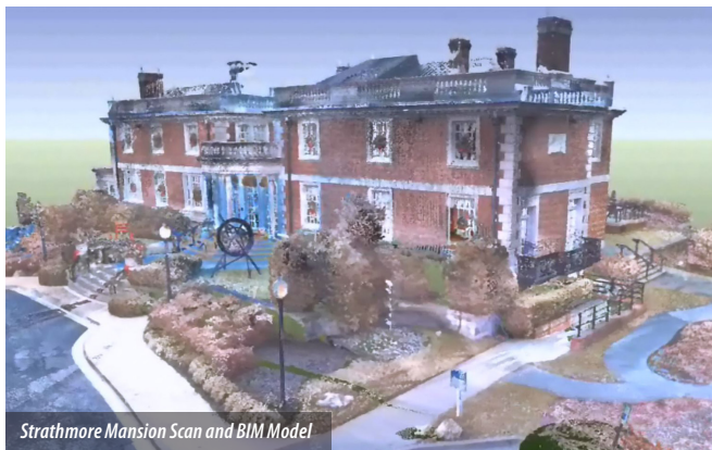
Strathmore Mansion Scan and BIM Model