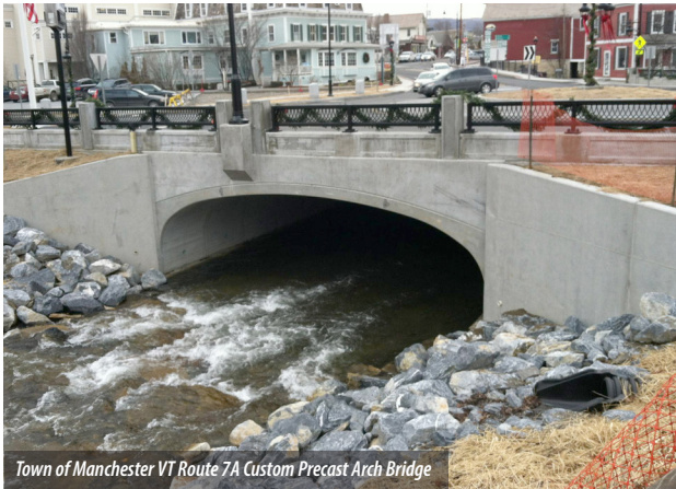
Town of Manchester VT Route 7A Custom Precast Arch Bridge

Delta Precast is a national leader in precast and related specialty structural design, is closely involved with key industry groups who drive standards and practices, and is licensed to provide engineering services in 49 states and the District of Columbia.