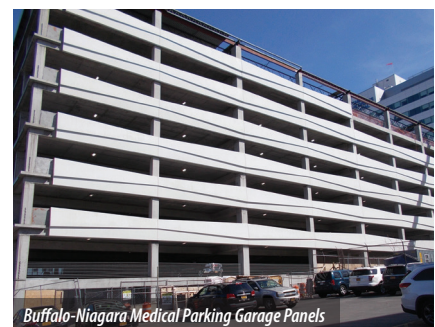
Buffalo-Niagara Medical Parking Garage Panels