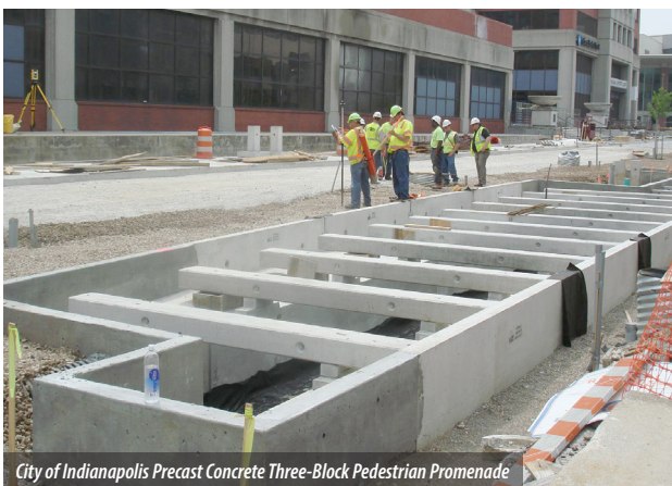
City of Indianapolis Precast Concrete Three-Block Pedestrian Promenade