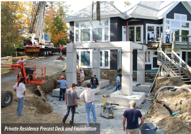
Private Residence Precast Deck and Foundation