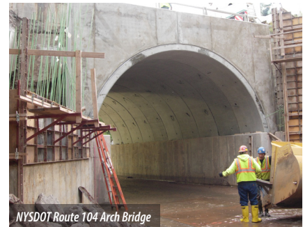
NYSDOT Route 104 Arch Bridge