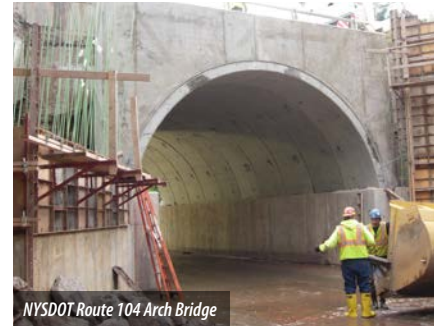
NYS DOT Route 104 Arch Bridge