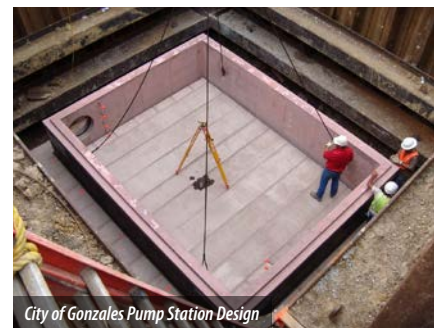
City of Gonzales Pump Station Design