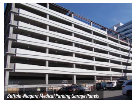
Buffalo-Niagara Medical Parking Garage Panels