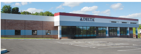
Delta Corporate Office in Endwell, NY - a LEED Gold Facility

Our QMS is the externally-audited system that governs virtually everything we produce or deliver. It ensures that every Delta project meets or exceeds client requirements and that we can grow the firm without sacrificing quality standards. Our QMS ensures that continuous improvement is a central part of the Delta DNA.