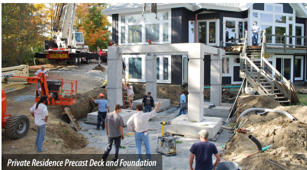
Private Residence Precast Deck and Foundation