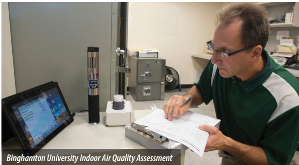
Binghamton University Indoor Air Quality Assessment